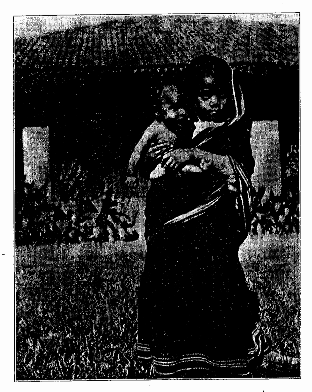
Buried alive and Rescued for God '

"'This one is saved, why do we feel like crying?" These words were spoken to me a few days ago when a helpless little three months old, opium fed babe was placed into our arms for love and protection. The answer came in the thought of the numbers of suffering little ones who are not saved, the host of little girl babies who suffer as infants, become girl-wives, and in cold statistics not less than 2,500,000 of our India's 25,000,000 widows are under ten years old and 'FOURTEEN THOUSAND OF THESE ARE UNDER FOUR YEARS OF AGE.'